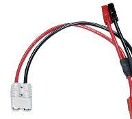
Y-Adaptor battery P/N 874-946-22