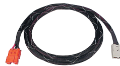
30' Output interface 10' P/N 877-567-10-022 50' P/N 877-567-10-021

Output interface cable: .....Available in 10', 30' or 50' lengths Battery interface cable: .....Choose ring lug, heavy-duty alligator clamp, or Y-adaptor* *Connects the power supply's battery input directly to the generator