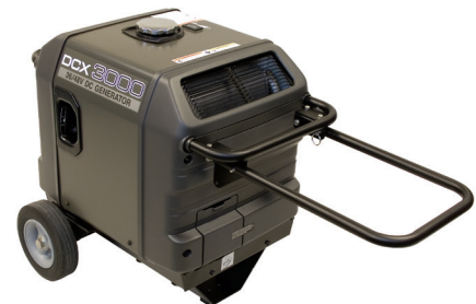
AlphaGen with wheel kit