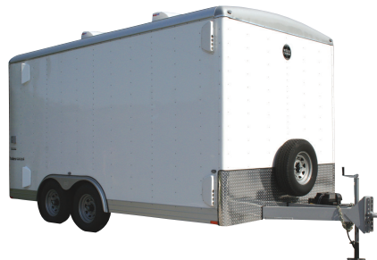
AlphaGen portable trailer