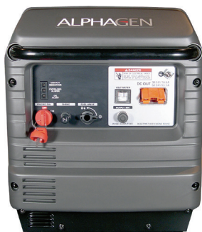
AlphaGen front view