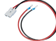
Ring lug battery interface