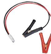
Alligator clamp battery interface P/N 874-946-20