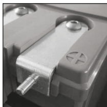
Option B: M6 male front terminal adapter