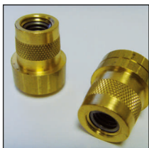
Option A: SAE post